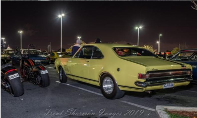
Trent Sharman Images 2019