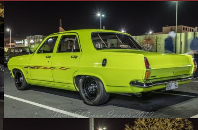
Trent Sharman Images 2019