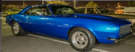
Trent Sharman Images 2019