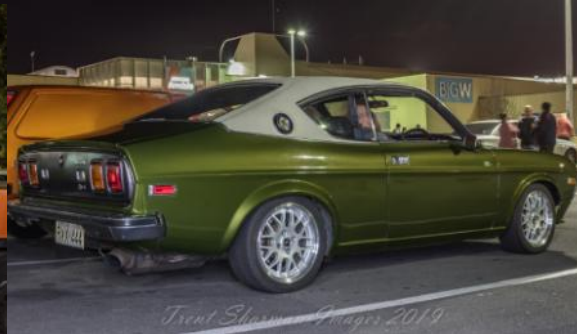
Trent Sharman Images 2019