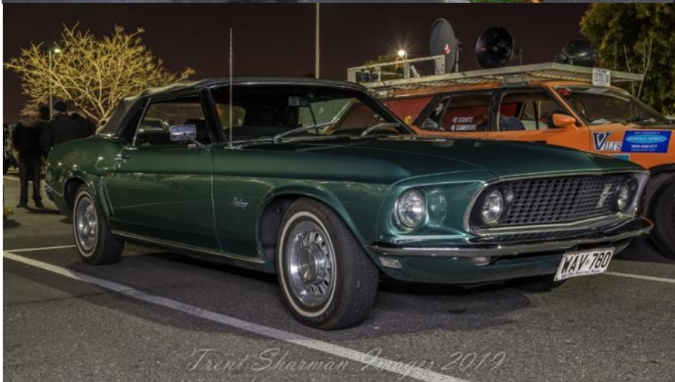
Trent Sharman Images 2019