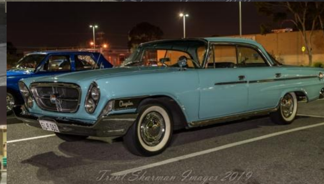
Trent Sharman Images 2019