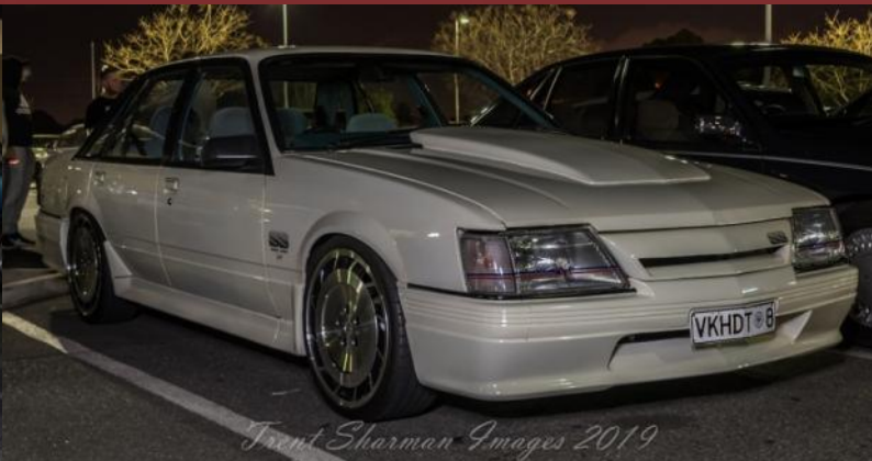
Trent Sharman Images 2019