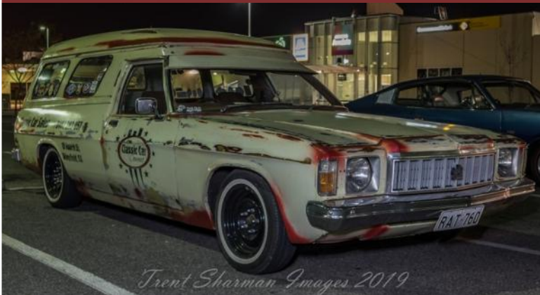
Trent Sharman Images 2019