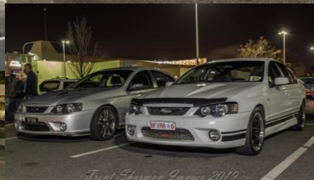
Trent Sharman Images 2019