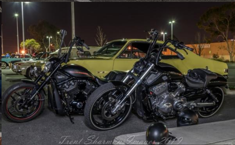
Trent Sharman Images 2019