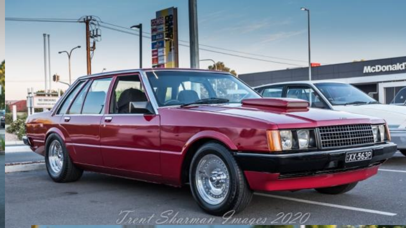
Trent Sharman Images 2020