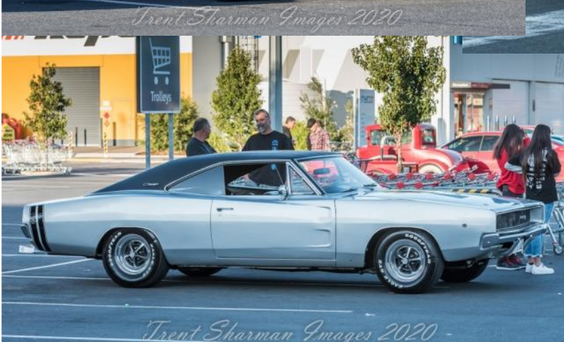
Trent Sharman Images 2020