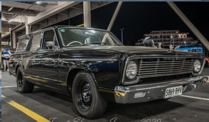
Trent Sharman Images 2020