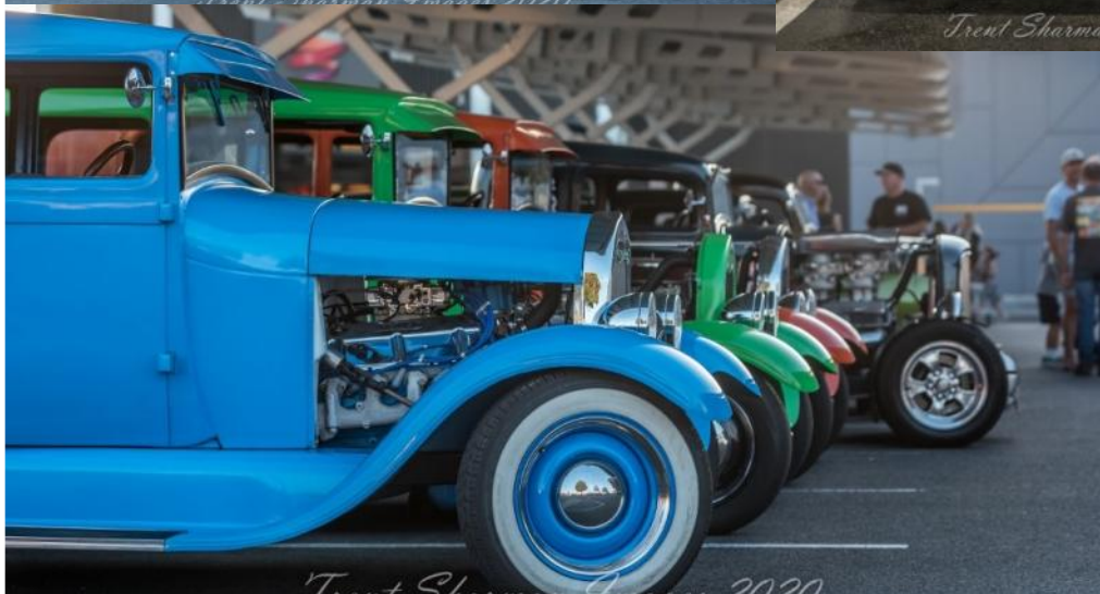
Trent Sharman Images 2020