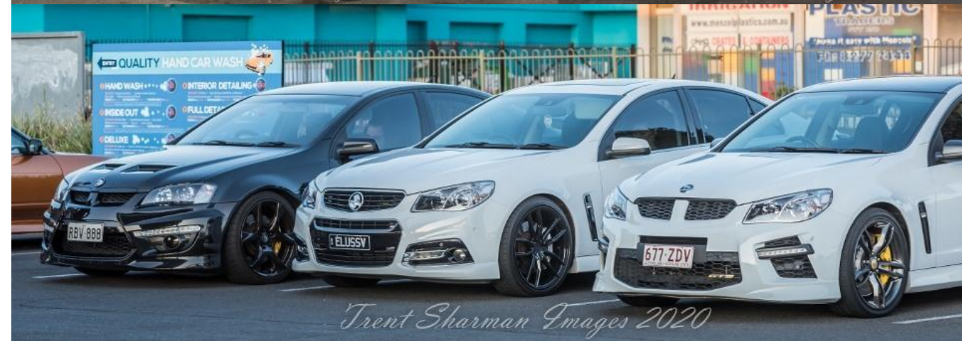
Trent Sharman Images 2020