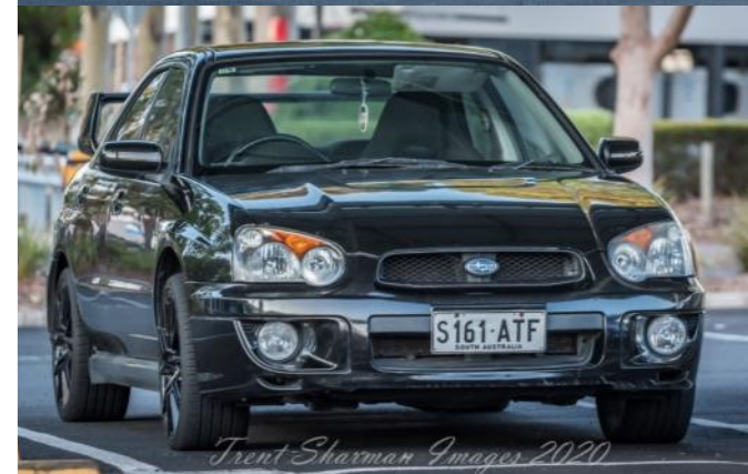
Trent Sharman Images 2020