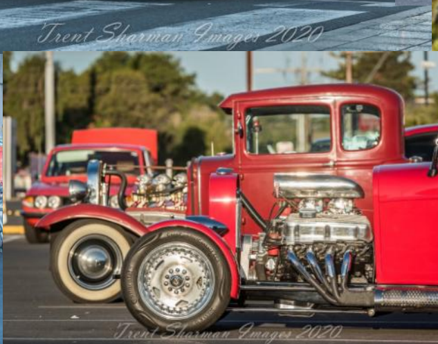
Trent Sharman Images 2020