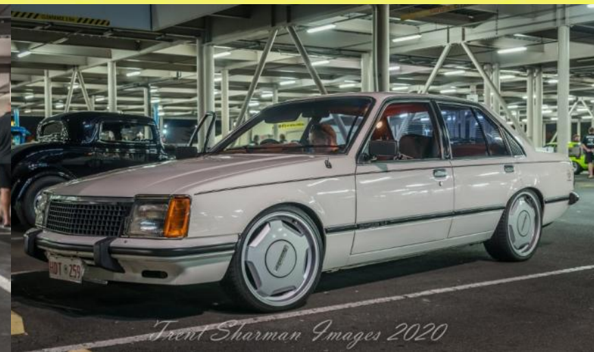
Trent Sharman Images 2020