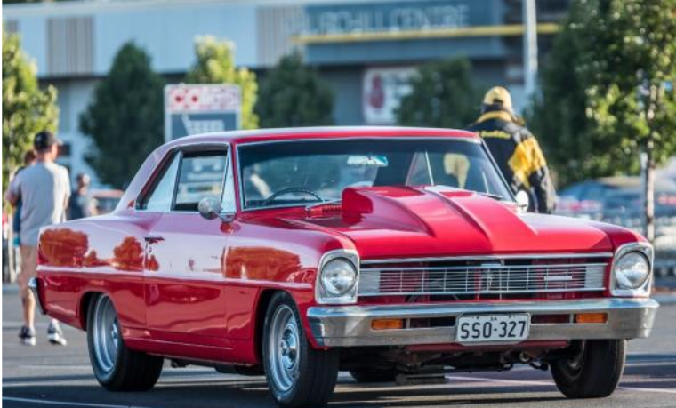
Trent Sharman Images 2020