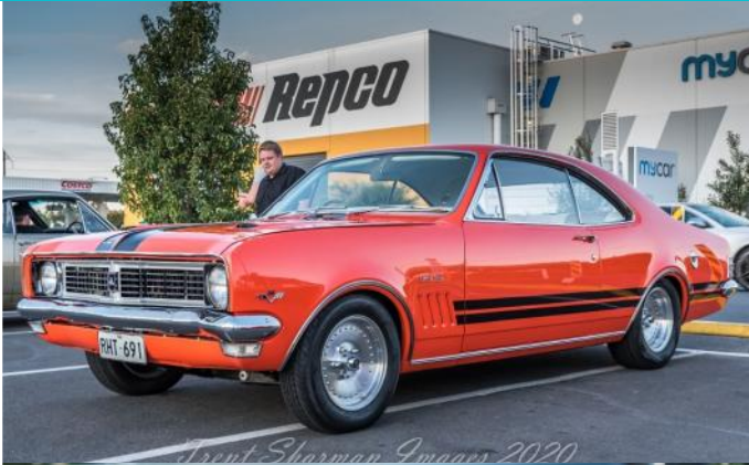
Trent Sharman Images 2020