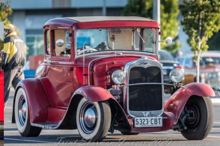
Trent Sharman Images 2020