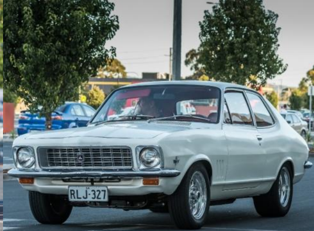
Trent Sharman Images 2020