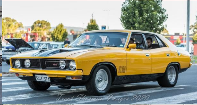
Trent Sharman Images 2020