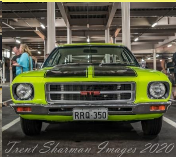
Trent Sharman Images 2020